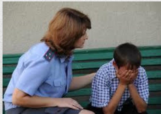
violation of the rules of labor