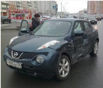
violation of traffic rules