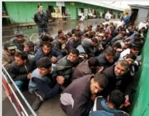
illegal entry of foreigners